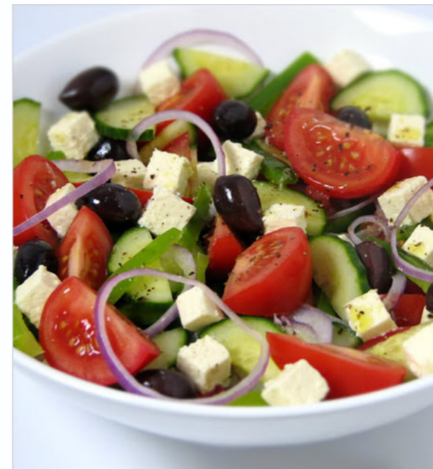
Freshly make some Greek Salad too