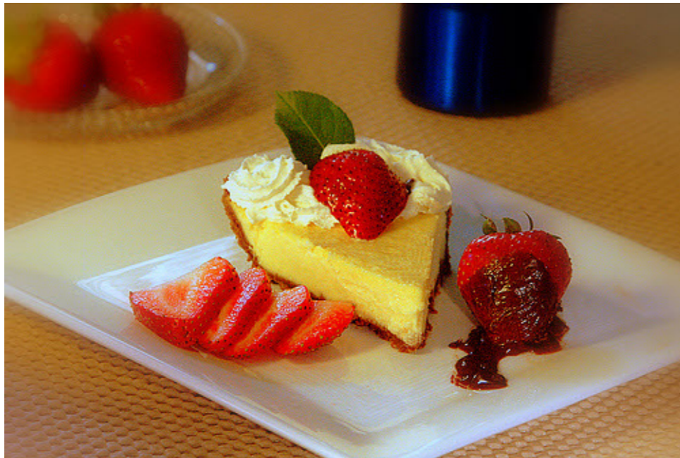
Lemon Cheesecake £1.25 (just add a few strawberries) or Authentic Alabama Chocolate Fudge Cake only 75p slice

Via our sister business www.goodevents.co.uk we can provide any equipment i.e. marquees, tables, glasses, dance floors, linen, etc.