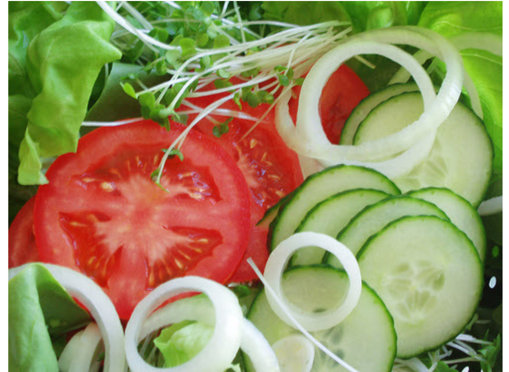
Use fresh crisp English Salad - lettuce, tomato, onion, cress.