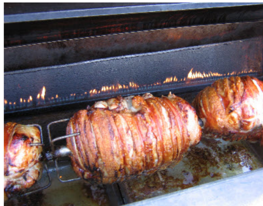
Giant legs of cider marinated pork on our spitroast