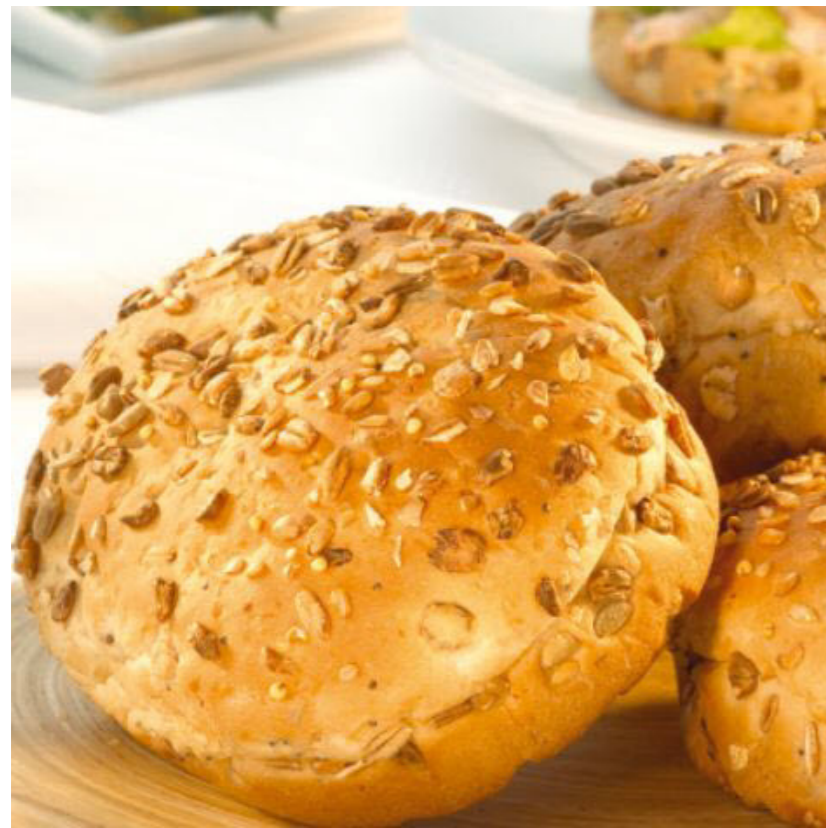
We will deliver a mixture of extra large 5" diameter, ready sliced white and brown bread rolls.

All the apple sauce you need is provided so all you need to do is to provide a suitable dish and a serving spoon.