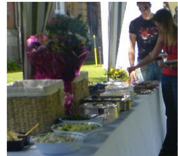
Display the food "buffet style" and then it's . .